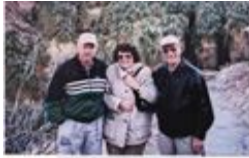
Love without measure